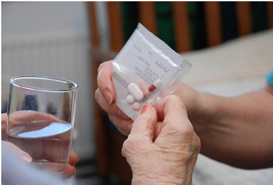
Medicines in a dose bag.